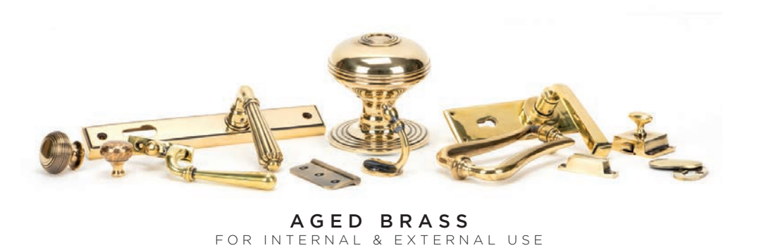
Our aged brass products are made from solid unlacquered brass, offering an abundance of character and charm. This finish is perfectly suited to period dwellings and will create a statement throughout. Due to the accelerated ageing process this finish undergoes, a darker patina gathers around the edges and recesses to contrast beautifully with the re-polished surface areas.

Made from a solid brass base material with a quality lacquer applied to its surface. This finish is designed to avoid discolouration and oxidisation, making it a great choice if low maintenance is desired. We recommend avoiding the use of any chemicals or cleaning products on this finish to prevent a breakdown of the lacquered top-coat.