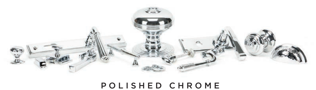
FOR INTERNAL & EXTERNAL USE

Please avoid using any form of chemical cleaner, e.g. oxalic acid or aerosol sprays to clean products, as this can permanently damage any finish. Only use our recommended products to clean, oil and maintain the life of your product.