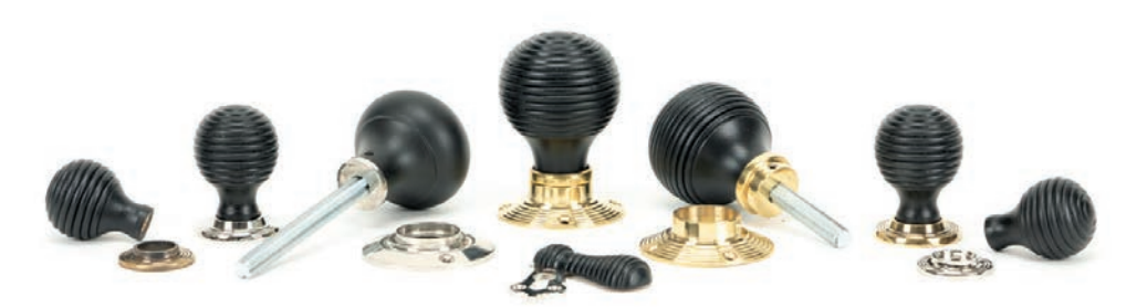
EBONY FOR INTERNAL & EXTERNAL USE

Satin chrome is created from a base metal of solid brass with a quality chrome plating applied to its surface. Satin chrome offers an understated alternative to polished chrome. Its blue traces and less reflective appearance make this finish popular with those who wish to elect a matt finish.