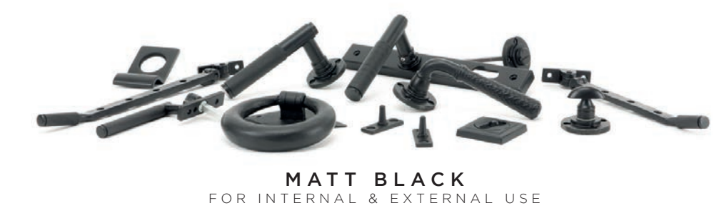
Our black finish is a popular choice in traditional settings, it has a subtle sheen and offers a bold contrast on both stained and painted timber alike. It is baked in a high-temperature oven giving it durable corrosion resistant properties. This finish is extremely low maintenance and perfect for use in bathrooms, kitchens or externally where damper environmental conditions are expected.

Our refined matt black finish has a distinct contemporary feel. Naturally, it looks great in ultra-modern interiors, but this versatile finish is timeless and will create a sophisticated statement in traditional or more rustic settings too. The matt black finish is applied to a base material of solid steel and then baked in a high temperature oven, resulting in a subtle black patina that emphasises the products clean silhouette.