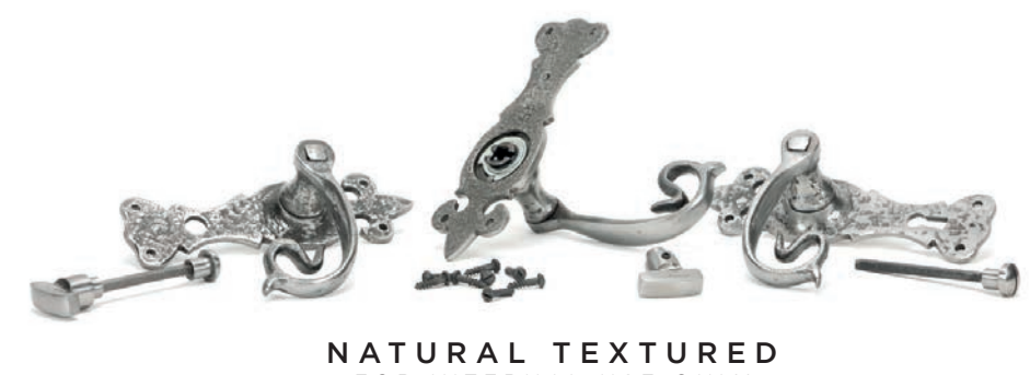
FOR INTERNAL USE ONLY

Our natural smooth products are made from a natural cast iron and finished with a clear matt lacquer. This produces a beautifully smooth look and offers a simplistic charm with versatile attributes, making it suitable for both traditional and contemporary settings.