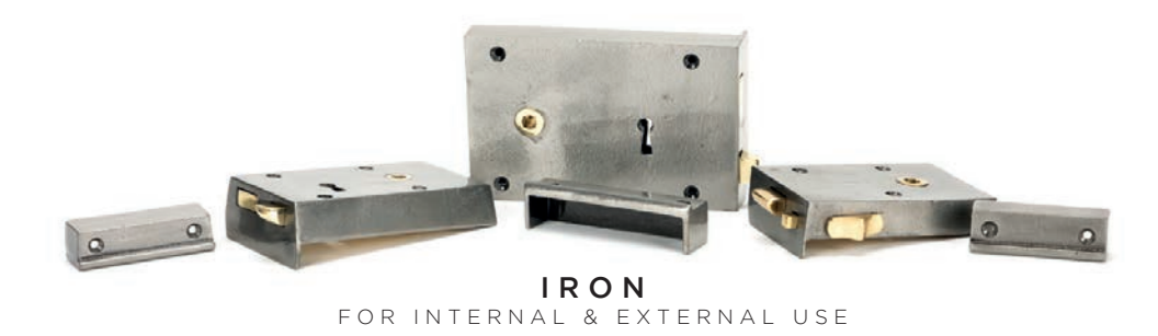
Made from solid iron, this finish highlights the natural beauty and texture of the metal. It is cast and finished with a clear powder coating to protect the iron from weather and moisture, this also gives it a rich depth and subtle sheen.

Please make sure any newly plastered or painted rooms are fully cured before fitting your ironmongery, as moisture may tarnish or rust some finishes. When painting, staining or plastering we recommend that all ironmongery is removed.